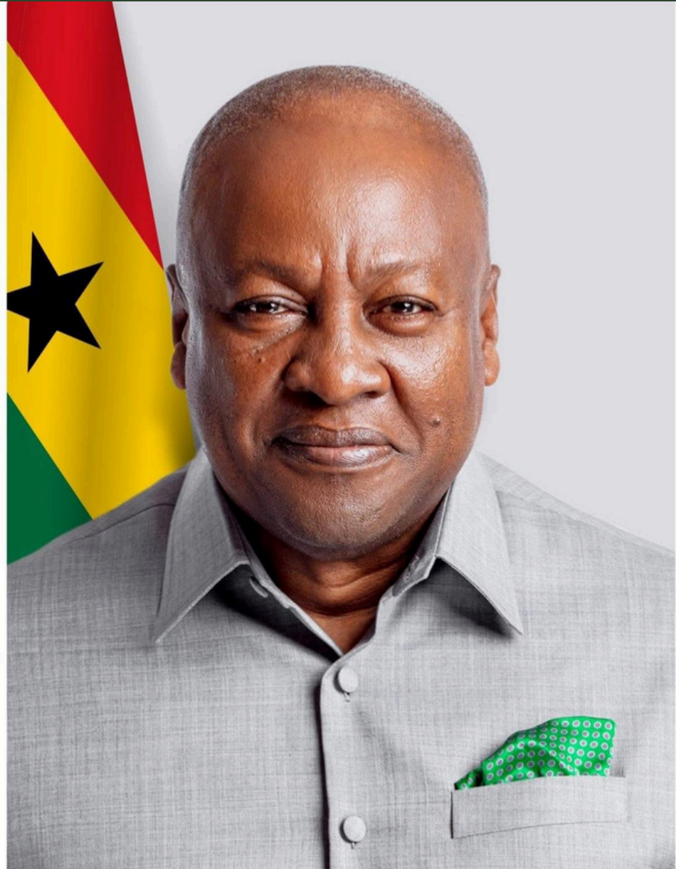
HIS EXCELLENCY JOHN DRAMANI MAHAMA

“ AGRIBUSINESS IS GHANA’S NEW GOLD. AND WE WILL MINE IT WITH STRATEGY, NOT LUCK.”